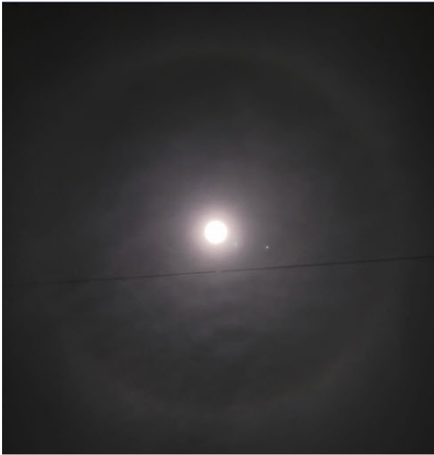
Simon Smollett M2