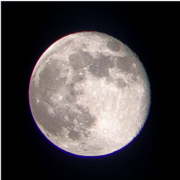
Raf – handheld with older Mobile phone and OAS binoculars 20x80.